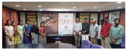
The Handloom Export Promotion Council celebrates 9th National Handloom Day on 07th August, 2023.