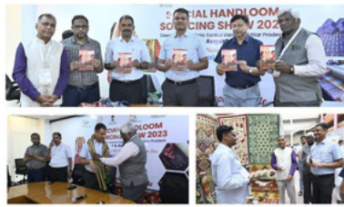
Special Handloom Sourcing Show, Varanasi coinciding National Handloom Day - Felicitation of the Chief Guest, release of fair catalogue by the Chief Guest and visit to the exhibition.