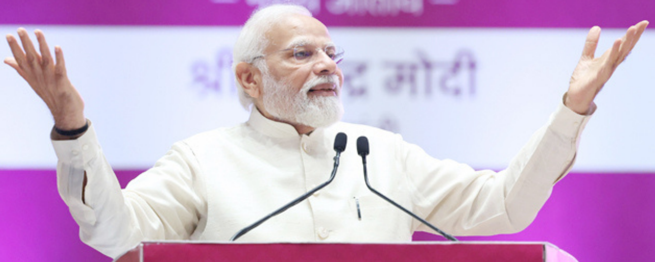
Bharat Mandapam, Pragati Maidan, New Delhi Monday 7 th August 2023