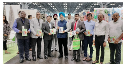
Home Textile Sourcing, Fair Catalogue brought out by the council was released by the Dignitaries.