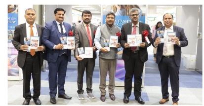
India Fashion & Lifestyle Show, Osaka '23 Fair Catalogue brought out by the council was released by the Dignitaries.